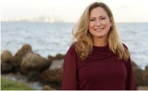
U.S. Senate candidate Debbie Mucarsel-Powell.

"As a woman and as a mother of two daughters, this fight is personal to protect our fundamental rights as women in this country to be able to make the decisions of when and how to start a family," Mucarsel-Powell said.