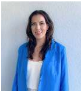
Barbie Harden Hall, Congress https://barbieforcongress.com/